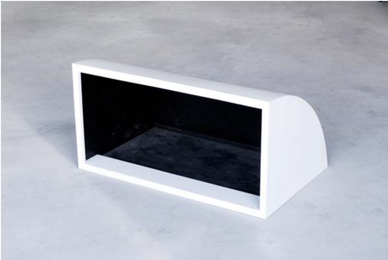
Aurélien Froment, La pièce du souffleur , 2007 Wood, 40 x 80 x 50 cm