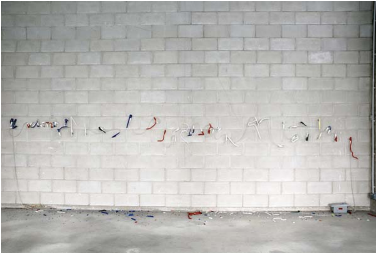
Ryan Gander, A Phantom of Appropriation , 2006 Installation, neon tubes, variable dimensions