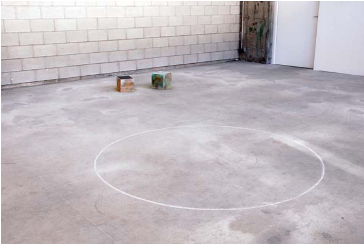
Clément Rodzielski, Retour chez les vivants , 2007

Inkjet print, spray, variable dimensions