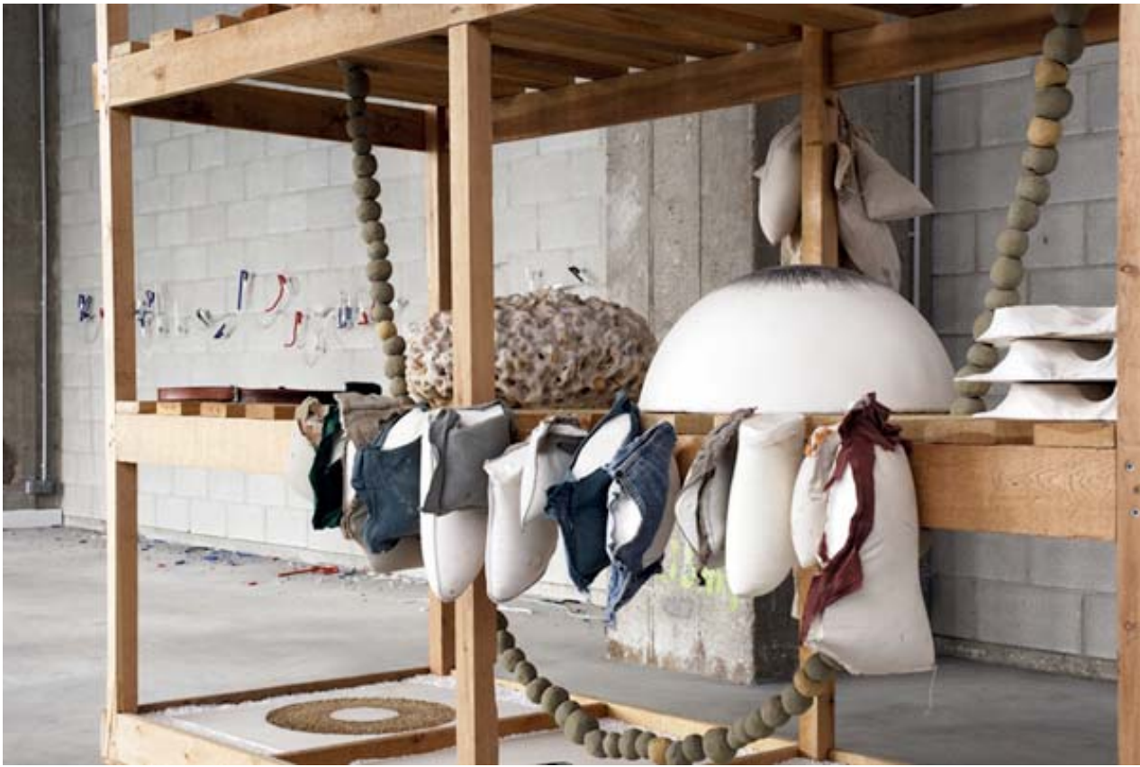
Michel François, La sieste, la réserve, le monde et les bras , 1991

Installation, shelve with 37 elements/sculptures / Collection Communauté française de Belgique (inv. 19325/ 1 to 37)