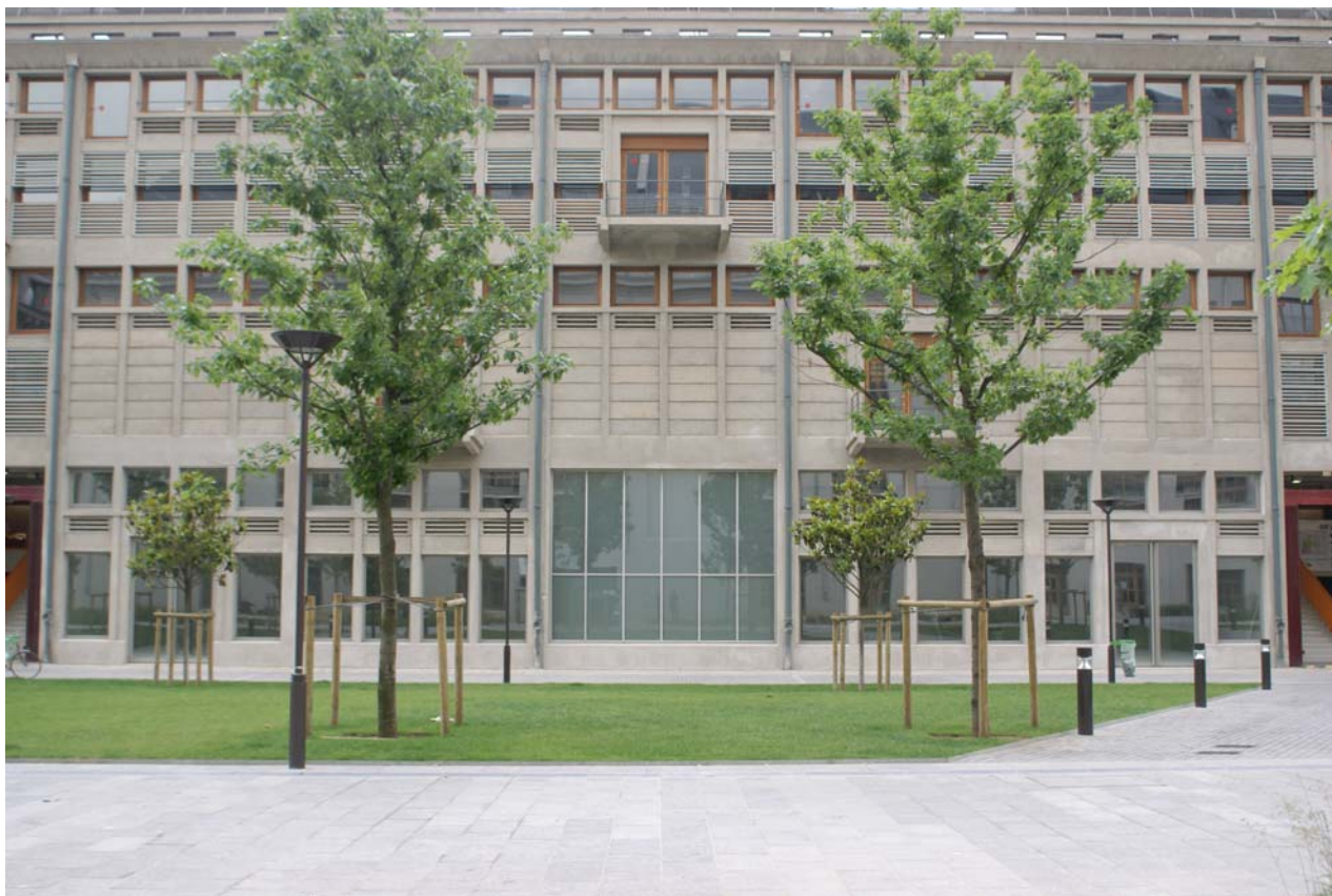
View of the façade of Bétonsalon

Transposed into the field of visual arts, the notion of storytelling developed by Benjamin raises several questions that we hope to address in this project. The first concerns the use of speech as a mode of circulation. How can a work be activated? How can it be told? Aside from orality, storytelling may also concern works that are not directly connected to the voice. In The Storyteller , Benjamin shows that storytelling is not limited to oral transmission: what is at stake is a specific relation to the work, approached in terms of circulation and activation in time. The exhibition In the Stream of Life assembles works where narrative is at play, conceived as the nexus of a network of connections and complex references. In relation to this idea of storytelling, we envisage the exhibition as a 'theatre of operations,' a space and time for circulation between the works.