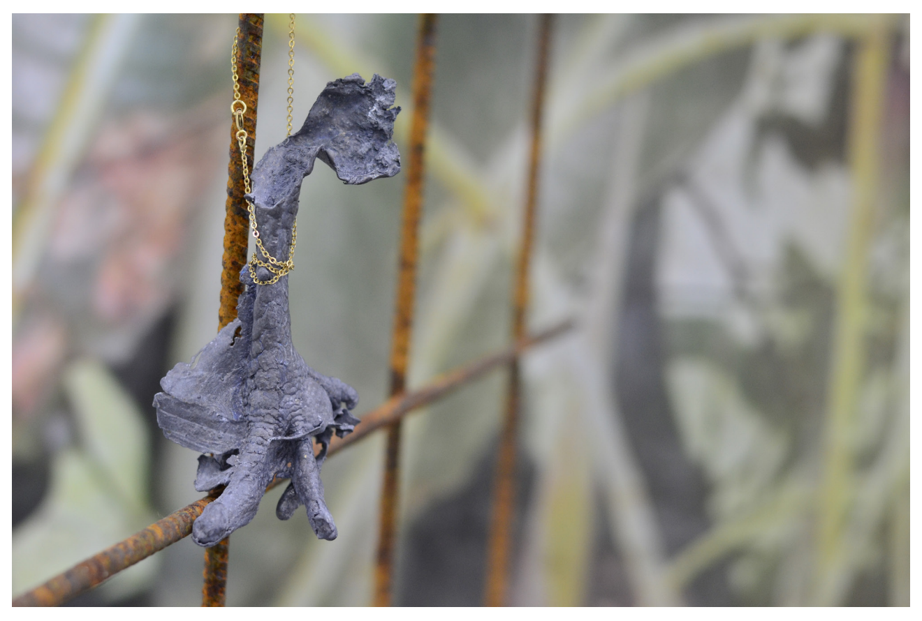
Culture Pop Marauders, Mains d'Œuvres, 2016.