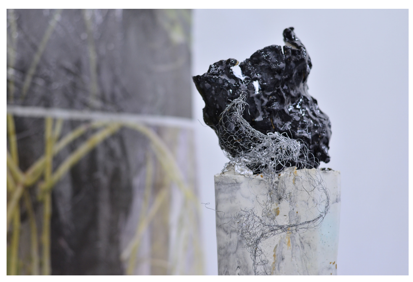
Culture Pop Marauders, Mains d'Œuvres, 2016.