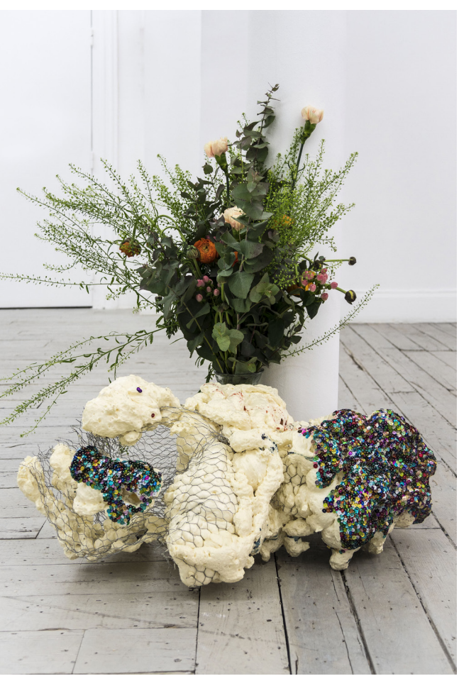
Hybris, untilthen, 2018.