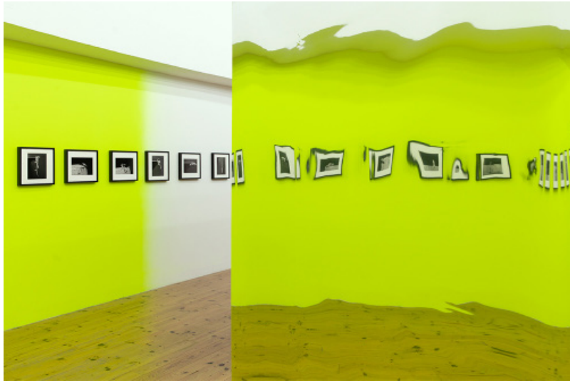
Alina Szapocznikow, Fotografie (Photosculptures) , 1971/2007, Exhibition view, The Fold of the Cosmic Belly at the Center of art image/ imatge, Orthez, 2021 © Adagp, Paris, 2021