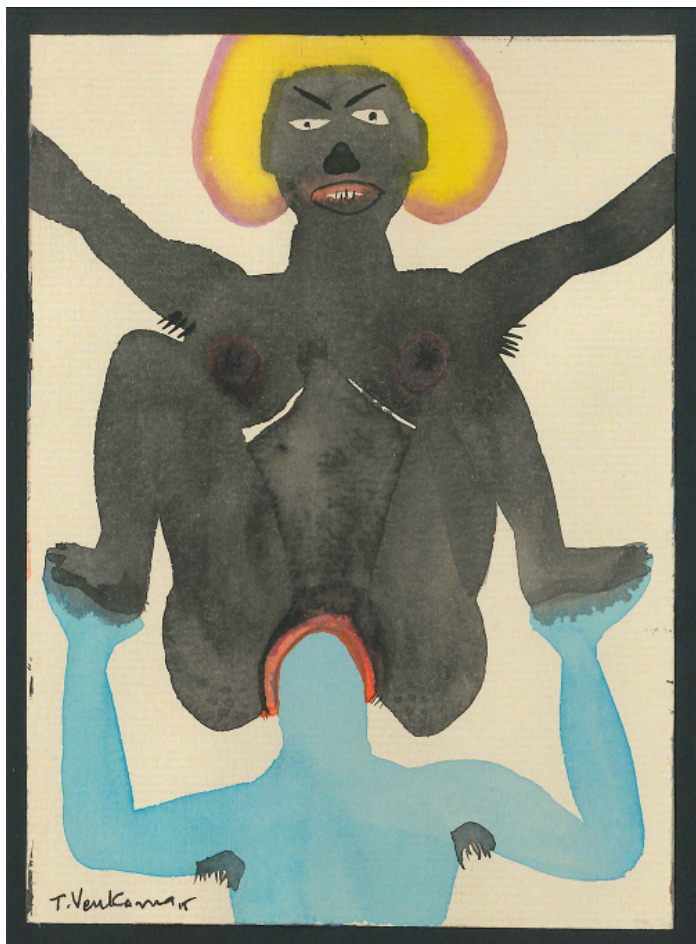
T. Venkanna, Untitled n°4 , s. d., watercolor on paper, 10 x 16 cm, Collection Antoine de Galbert, Paris