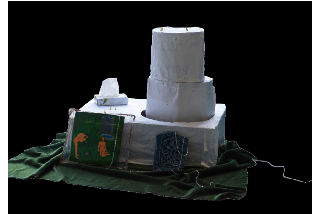
Adrian Mabileau Ebrahimi Tajadod, S trip-Tears , 2017, sculpture, rotating column, cardboard, white laminated paper, ceramics, acrylic paint, resin, Dior<sup>™</sup> cloth, 157 x 112cm. Courtesy de l'artiste.