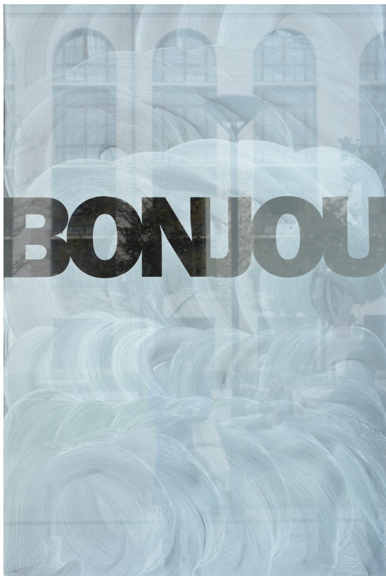
Sylvie Fanchon, BONJOURSINOUSDISCUSSIONS , 2021, 10 phrases inscrites successivement au blanc de Meudon sur vitres, 440 x 221 cm

Toeing the line between politeness and pushiness, invitation and imperative, Cortana attempts to make itself useful ( IMHERETOHELPPDOYOU NEED ANYTHING ), to engage users in conversation ( HELLOHOWABOUTACHAT ) or to improve their productivity ( ICANREMINDEYOUOFIMPORTANTTHINGSANDMUCHMORE ), whilst at the same time warning them not to get too familiar ( PLEASEDONTPROVIDEANYPRIVATEINFORMATIO ). Its limitations nonetheless soon become apparent ( IMSORRYIDONTUNDERSTAND ). This simple yet already unintelligible language is characteristic of the straightforward and one-dimensional relationships offered by artificial intelligence assistants, which, beneath a helpful and servile veneer, gather information to increase technology companies' profits and power. Fanchon's pictorial production is based on pre-existing elements drawn from language and visual culture. Here she uses Cortana, a device at once intrusive, dystopian and comical, as a source of motifs for her paintings and in situ interventions. Facing out over the esplanade in front of Bétonsalon, eliciting questions and curiosity, Cortana's invitations and their apparent authority are contrasted with the fragility and transparency of the surface on which they are inscribed.