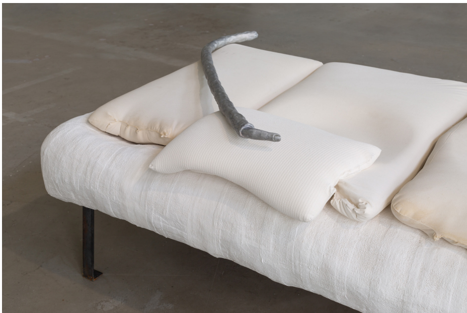
Hedwig Houben, Homer , 2019, plaster bench; Finger Tool , 2019, aluminium sculpture. Collection Frac Île-de-France.

Through this staging of herself and perhaps of her own weariness, Houben interrogates the relationships of dependence – of domination – that link the body and the mind. At the same time, she explores the subjective and emancipatory potential of parasitic objects, distractions and words, and their capacity to generate new narratives at the intersection of the real and the imaginary.