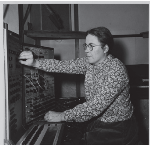
Pauline Oliveros in the studio of the Tape Music Center in San Francisco with a Buchla 100 synthesizer, 1966