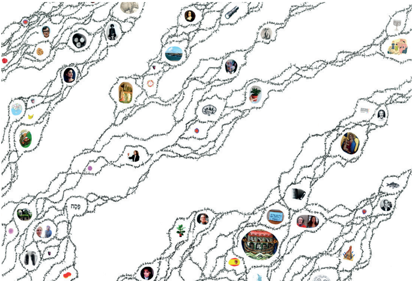
Violaine Lochu, Futur Intérieur (detail), 2020, series of three drawings, 50x65 cm, ink and collage, AWARE production. Violaine Lochu / Adagp, Paris 2023.