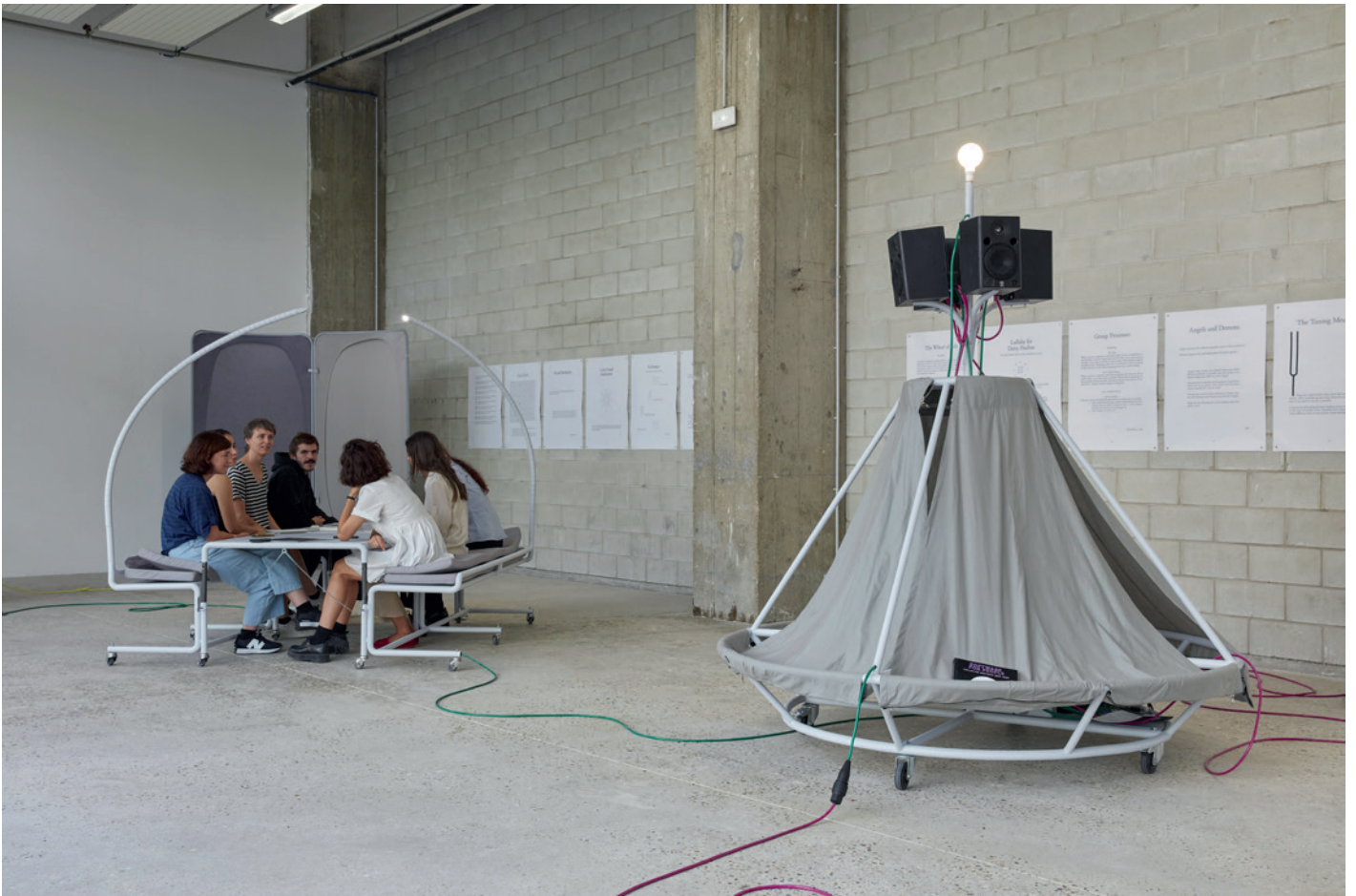
View from the exhibition "Un-Tuning Together. Practicing listening with Pauline Oliveros" With artworks by Konstantinos Kyriakopoulos and Pauline Oliveros's partitions, Bétonsalon – center for art and research, Paris, 2023.

↘ Installation opening : Friday, September 22, from 4pm to 9pm shown until Saturday, December 2 nd