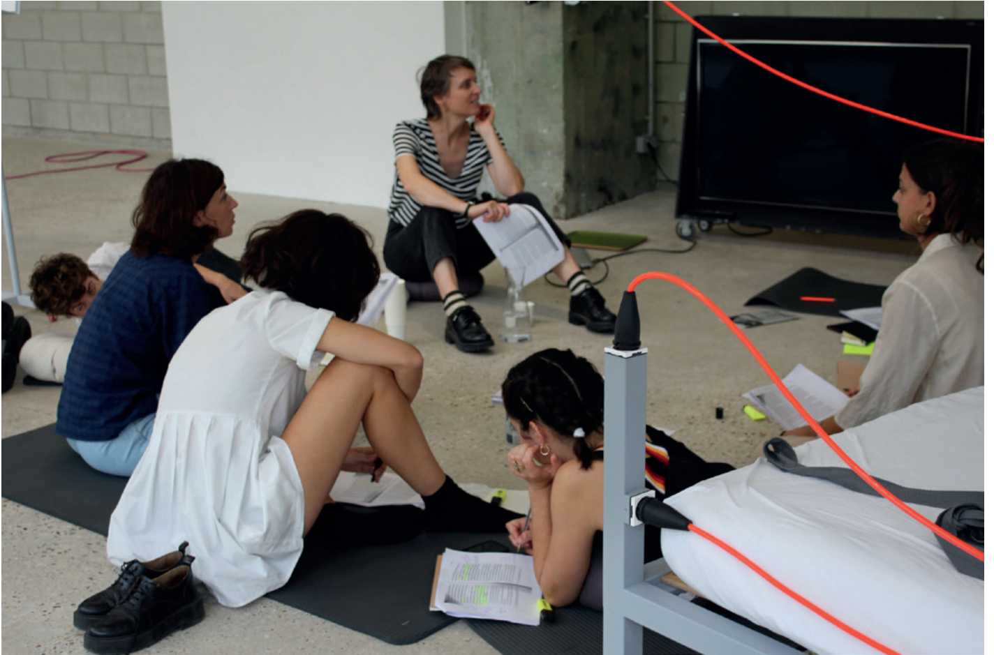
View from the exhibition "Un-Tuning Together. Practicing listening with Pauline Oliveros" during a translation workshop of Quantum Listening by Pauline Oliveros, Bétonsalon, center for art and research, Paris, September 2023.