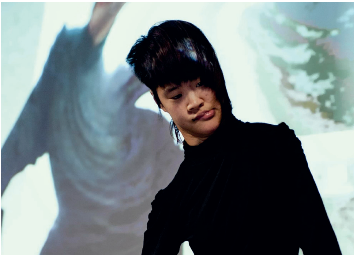
Portrait of No Anger.