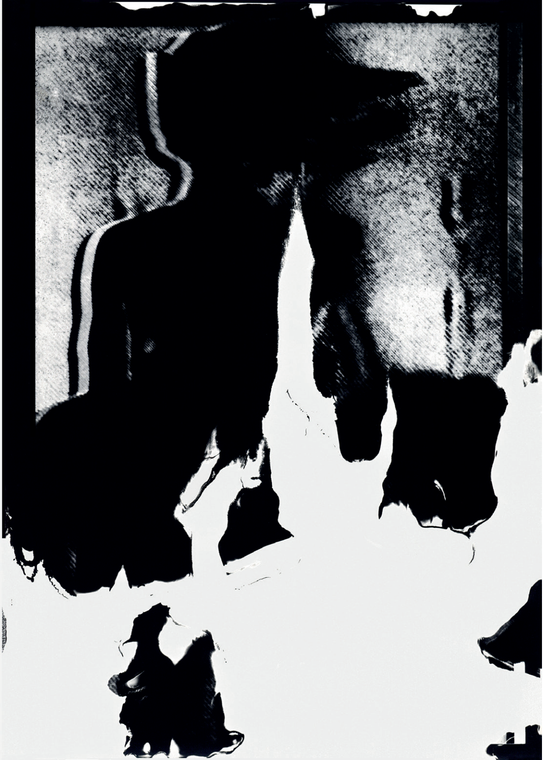
Front page and page 8: Angélophanies, 1987-1988 Analogue photographs from The Angel Cycle