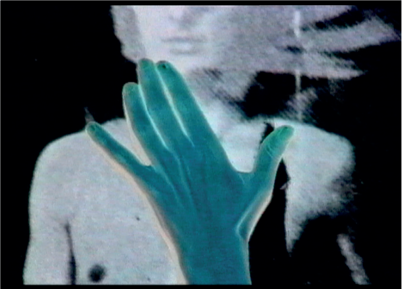
Personal Statement , 1994