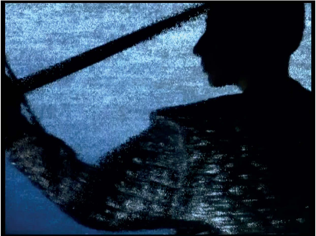
Sword and Sea, 2024 Digital video from The Angel Cycle With Katerina Thomadaki © Klonaris/Thomadaki and ADAGP Paris 2024.