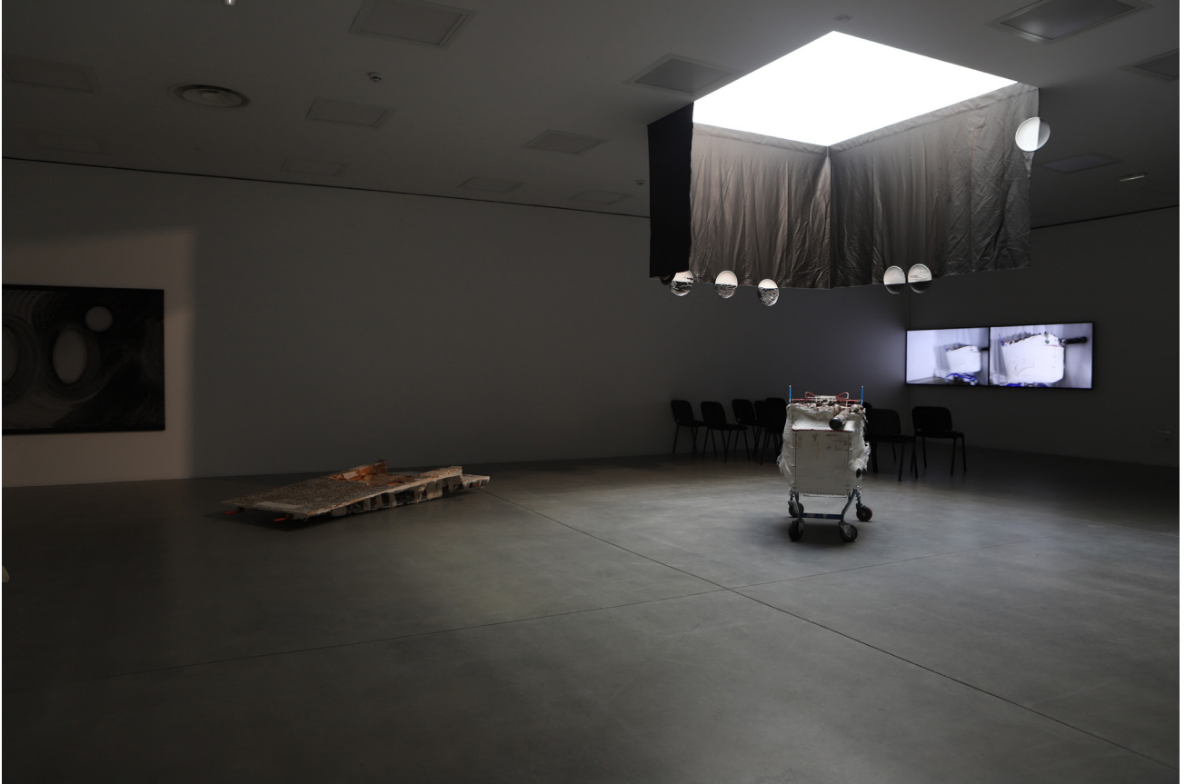
View of Florian Fouché's exhibition "FIN DE PARTIE PRÉLUDE", GwinZegal, Guingamp, 2024.