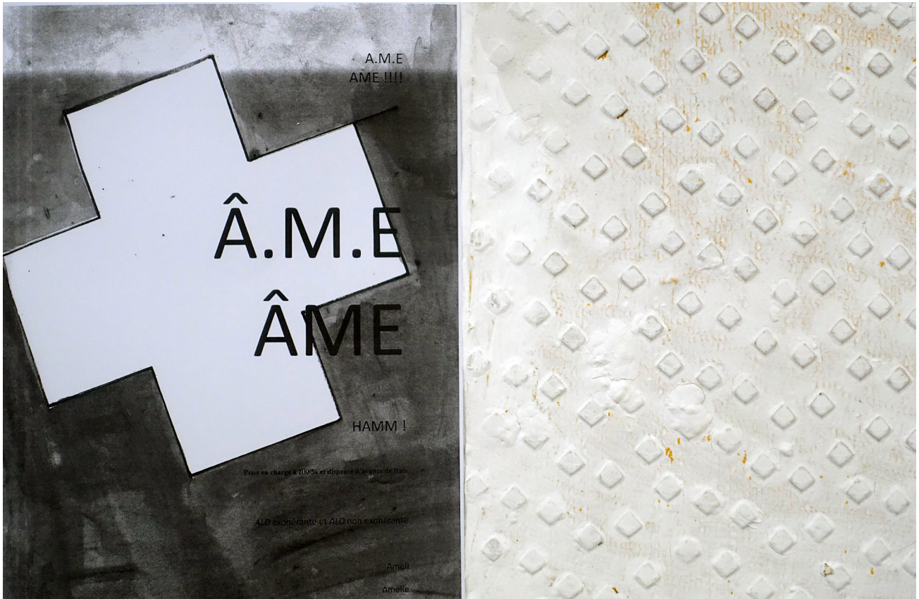
Florian Fouché, Passage de l'Â.M.E. (detail), 2024

Cotton canvas, adhesive strips of studded passageway, paint, fine particles, leaflets.